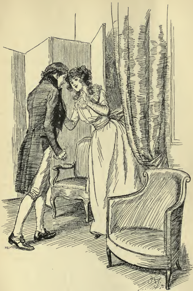
Drawing him a little aside.